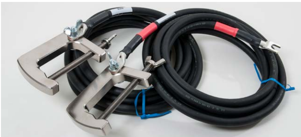
Cable set GA-07052. Cable cross section area 70 mm 2 and 100 mm clamp jaw width. The sets GA-07102 and GA-09152 have the same clamps.