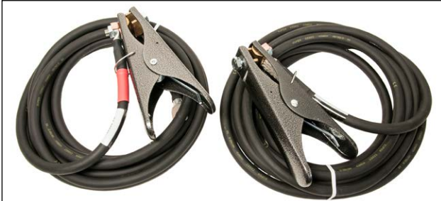
Included cable set, GA-05052. Cable cross section area 70 mm 2