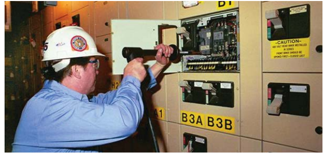
MCCB testing using the HCP2000