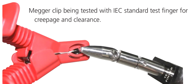
Megger clip being tested with IEC standard test finger for creepage and clearance.