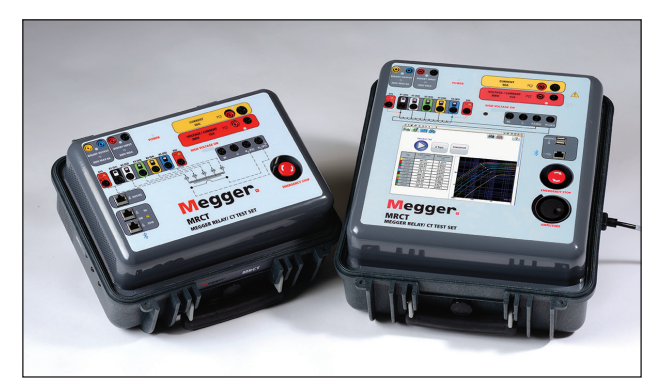
The MRCT is available in 2 onboard display/enclosure options.

■ Industry leading test duration using patented simultaneous multi tap measurements - The MRCT system can provide concurrent measurement of voltages on all taps during CT saturation, and ratio and polarity testing. This allows the MRCT system to calculate the knee points and ratios of all windings at the same time thus eliminating the need for multiple tests on a CT. This will drastically reduce testing time.