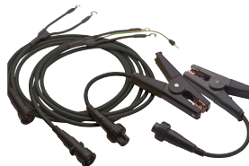
+ KC1 Kelvin clip 3 m leads