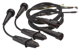
+ DH4-C probe 1.5 m leads